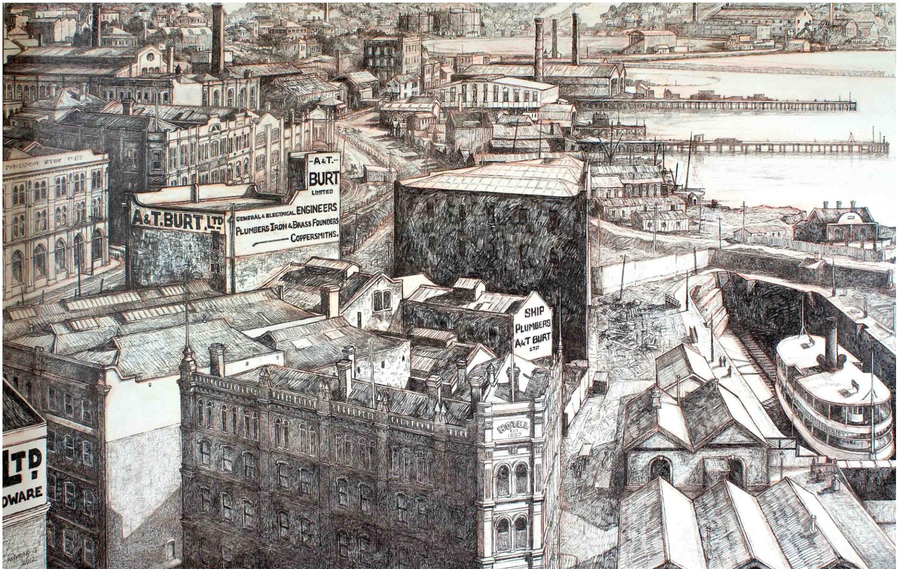
Auckland Waterfront 1912. Downtown business and industrial area of the Auckland waterfront, towards Freeman's Bay. Dimensions: 950(H) x 1500(W) x 50(D) mm. Medium: Pencil with varnish wash on canvas