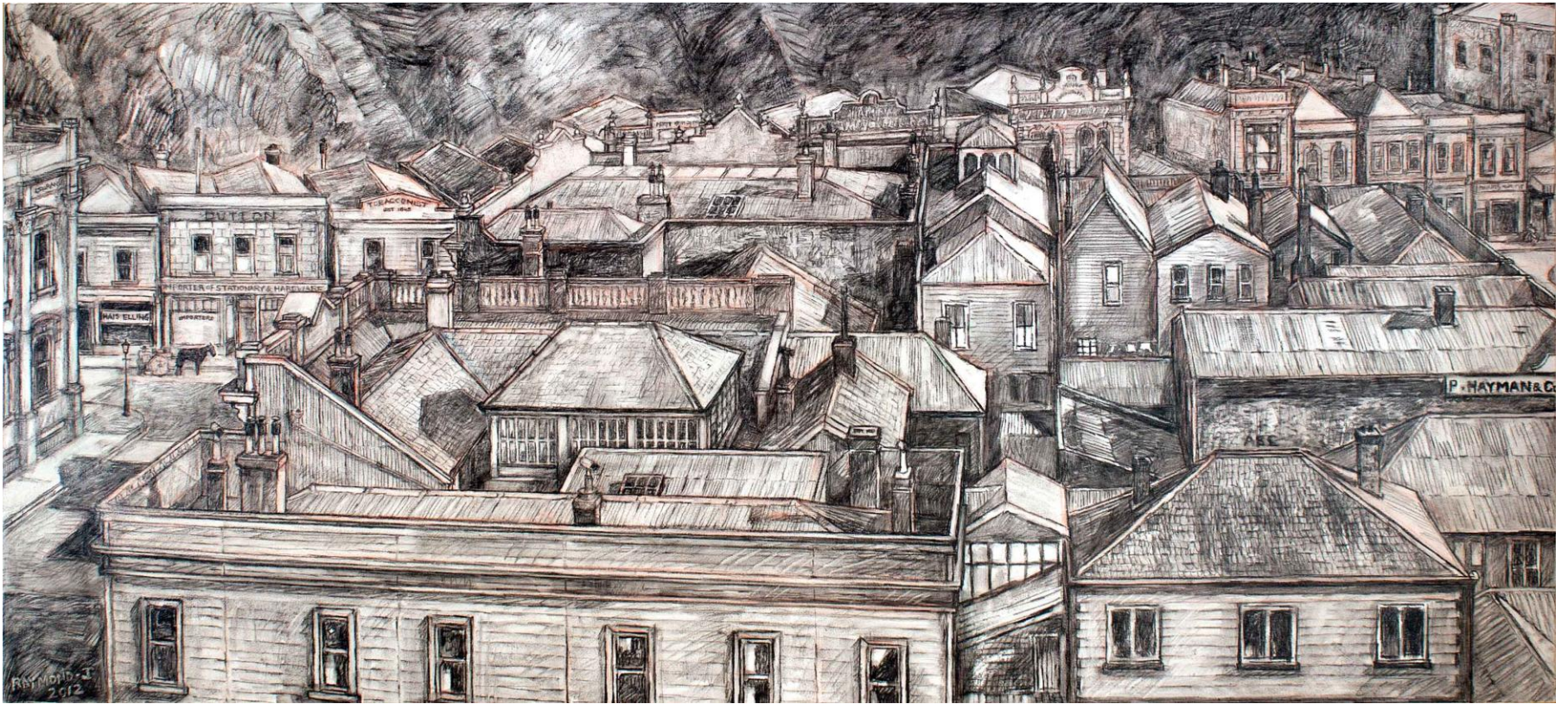
Historic Wellington_1885. Historic architectural study.

Dimensions: 600(H) x 1300(W) x 50(D) mm. Medium: Pencil with varnish wash on canvas