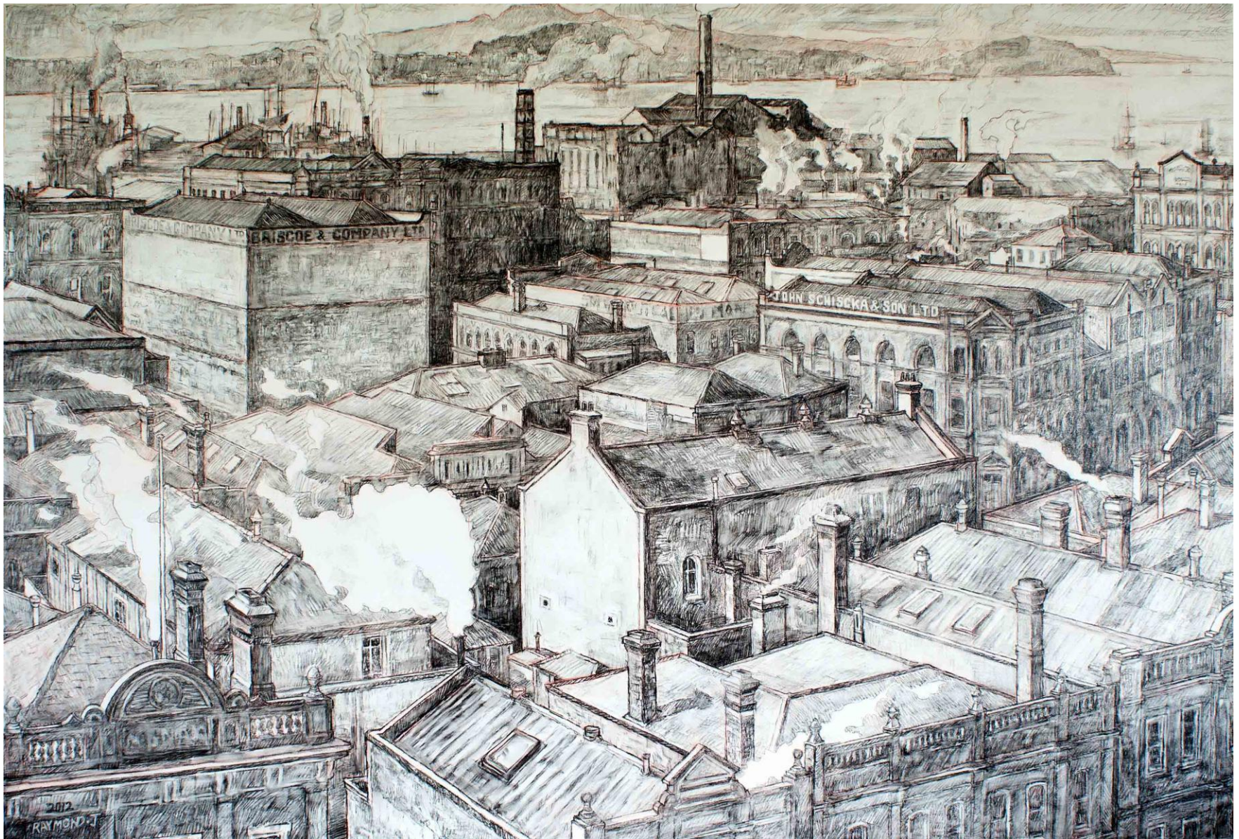
Historic Auckland 1912 from Shortland St. Historic architectural study - downtown Auckland 1912. Dimensions: 1000(H) x 1500(W) x 50(D) mm. Medium: Pencil with varnish wash on canvas