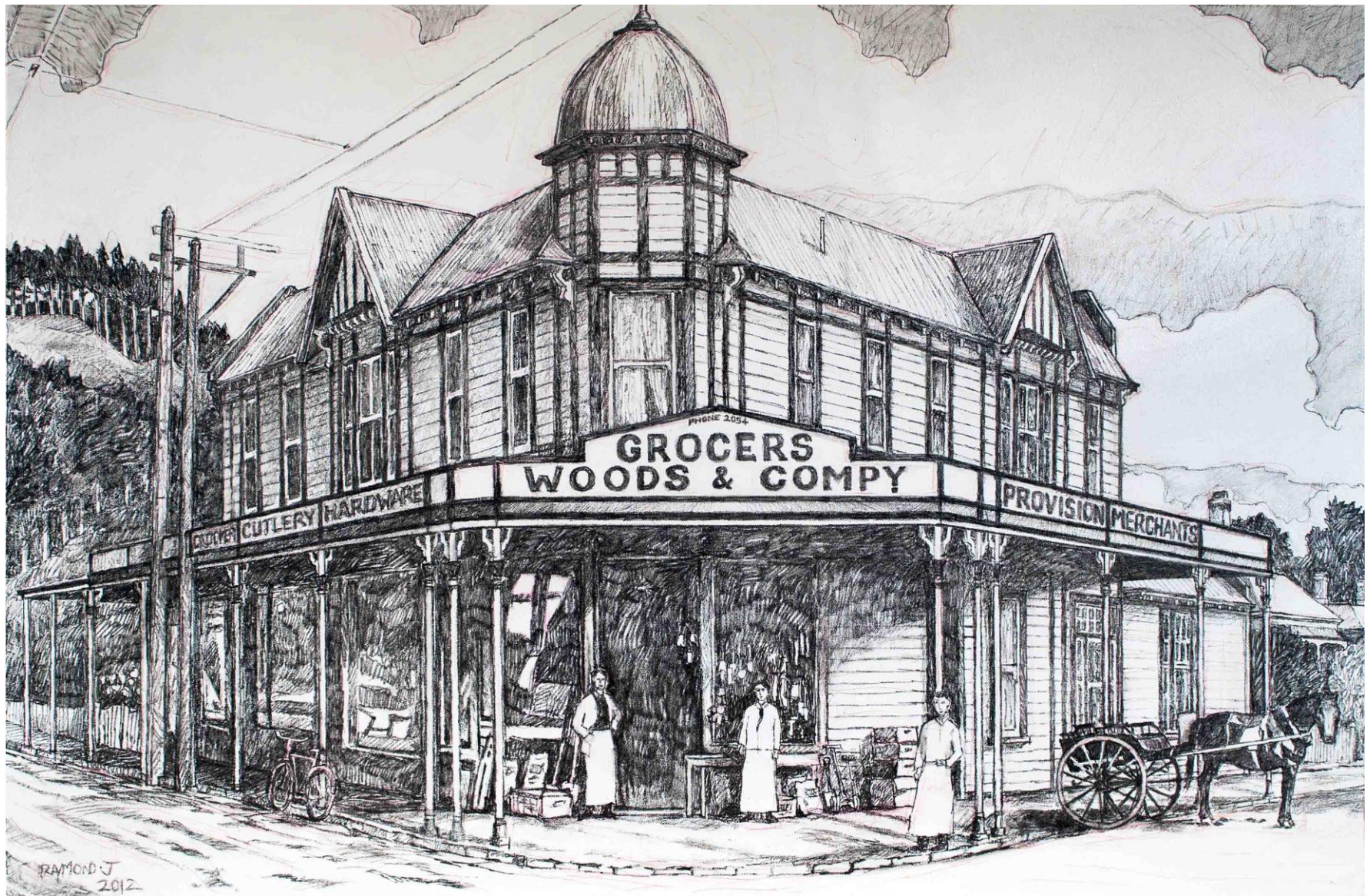
Historic Mt. Eden – 1907 (Woods Grocery Store). Historic architectural study. Dimensions: 650(H) x 950(W) x 50(D) mm. Medium: Pencil with varnish wash on canvas