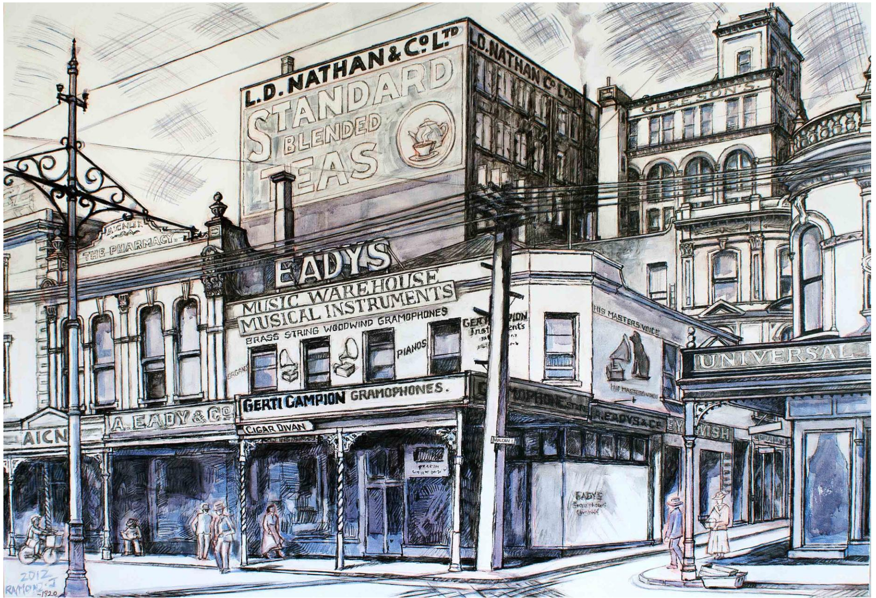
Standard Teas and Eadys. Historic architectural study - Queen Street and Vulcan Lane in the 1920s. Auckland Dimensions: 950(H) x 1500(W) x 50(D) mm. Medium: Pencil with varnish wash on canvas