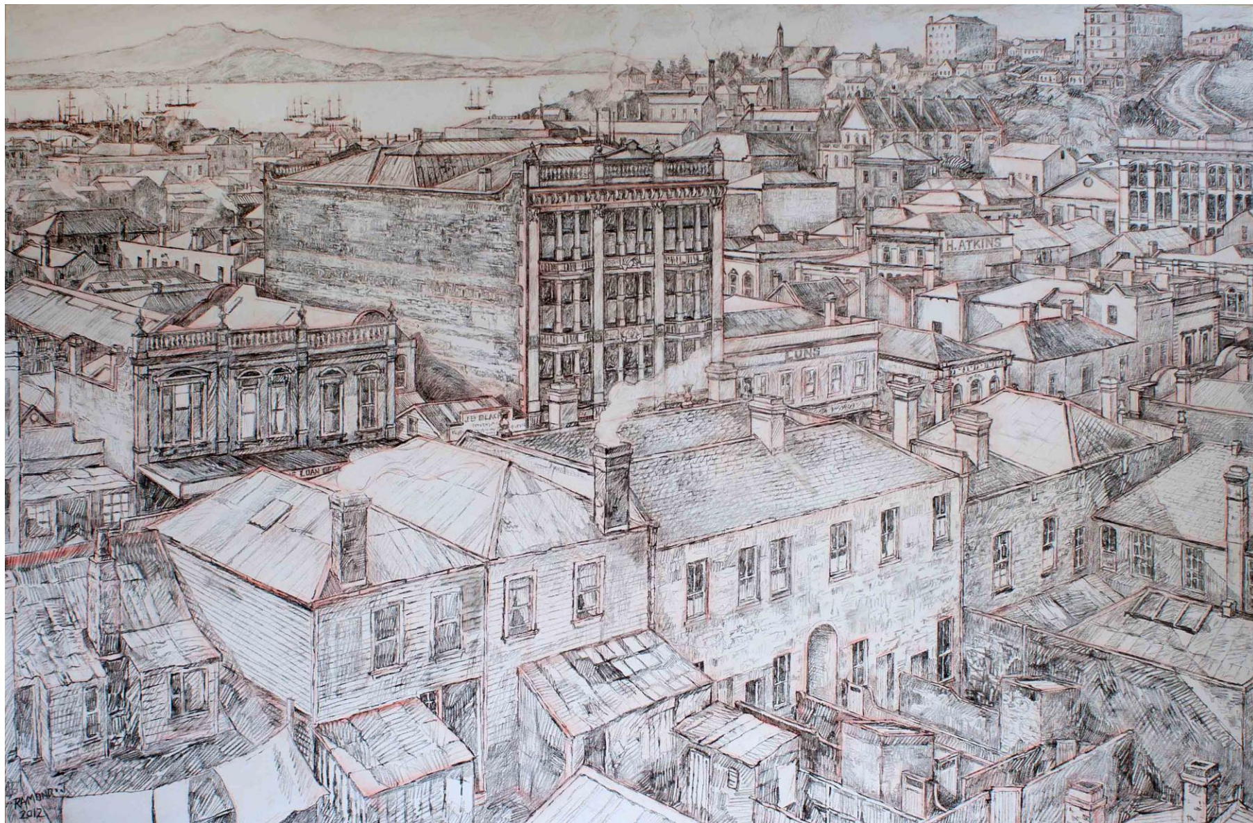
Auckland CBD 1880s. Historic architectural study.

Dimensions: 970(H) x 1500(W) x 50(D) mm. Medium: Pencil with varnish wash on canvas