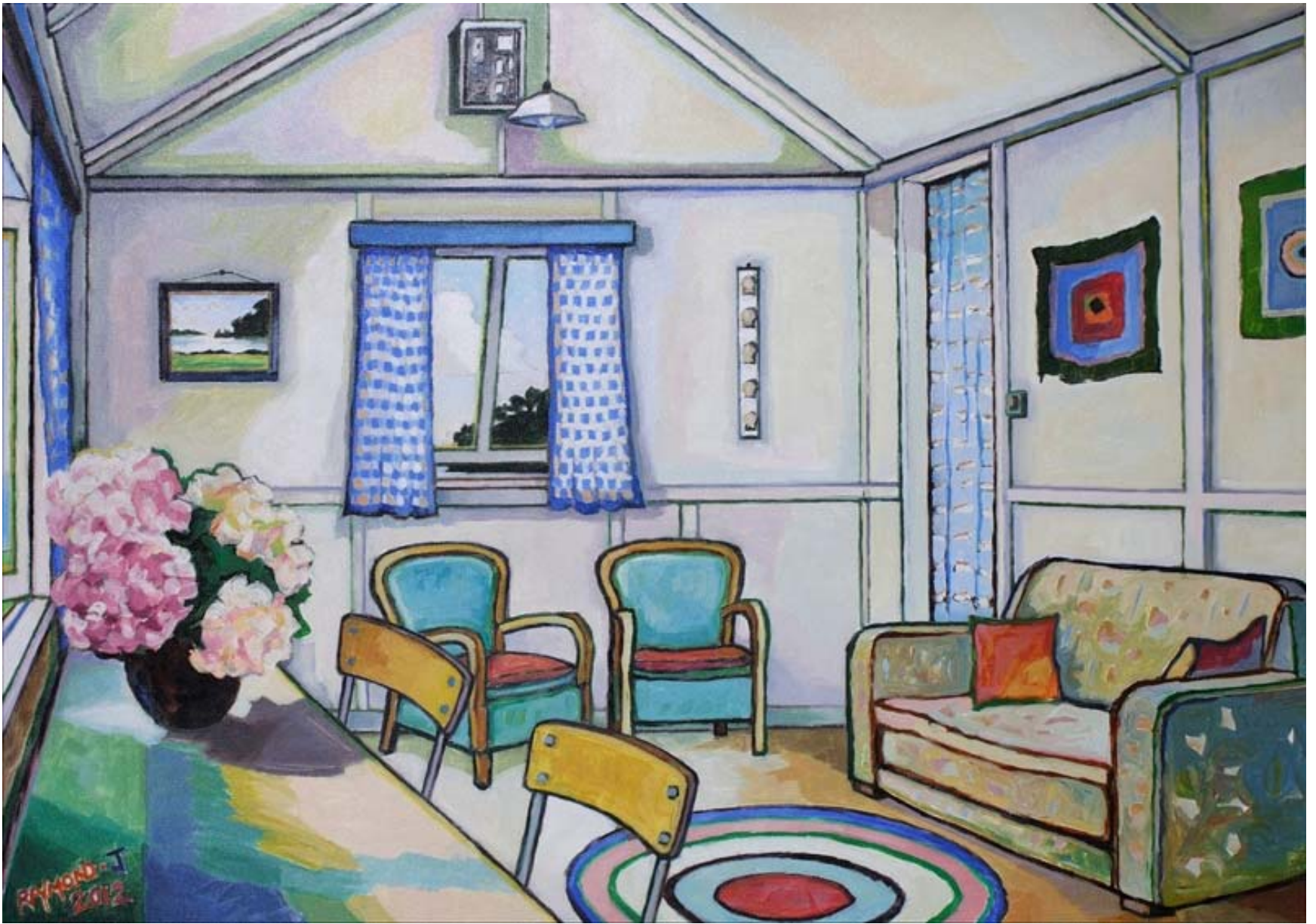
22. The Basic Bach – Oils on canvas Size: 850mm x 600mm