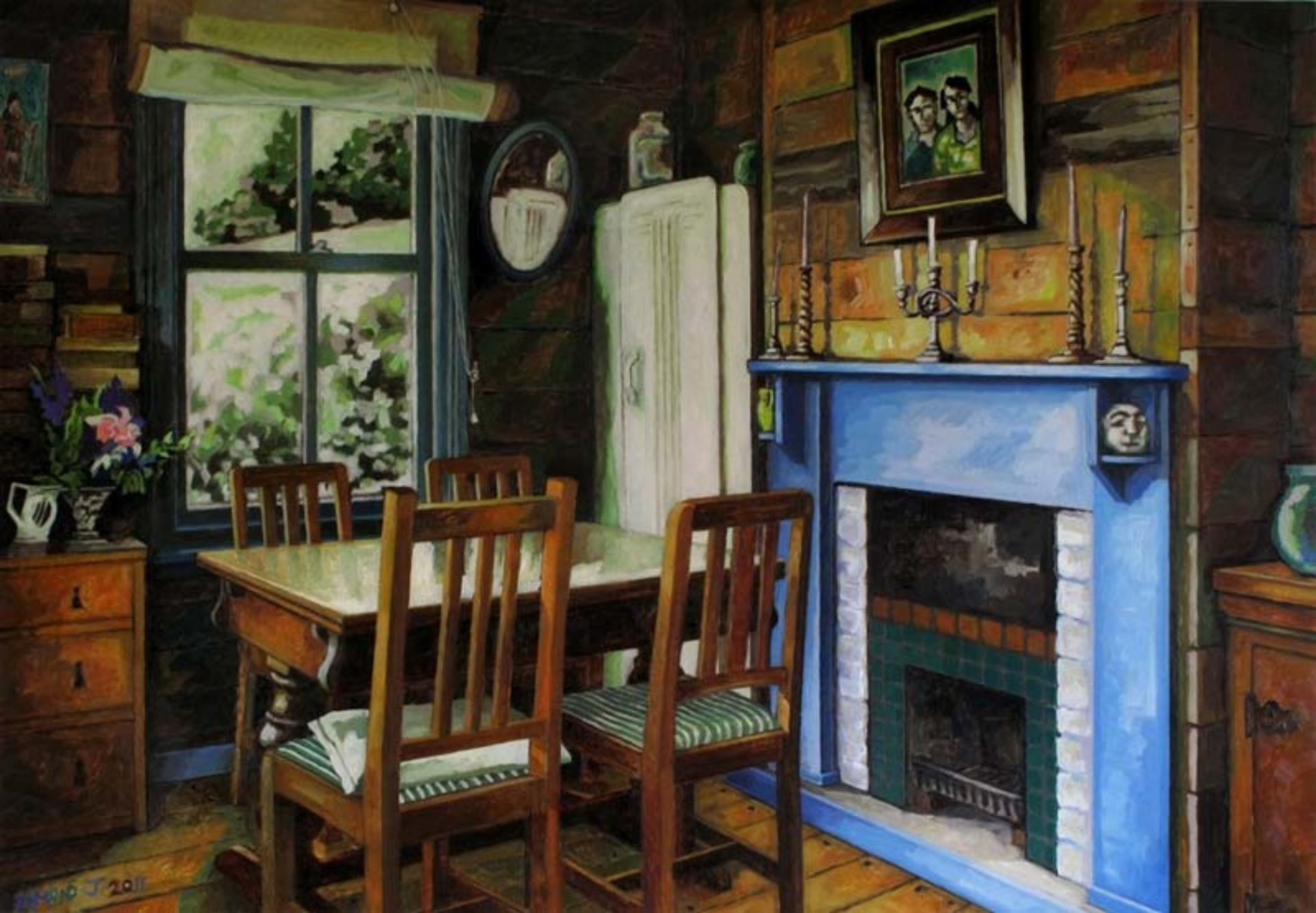
5. New Zealand Cottage Interior - A classic New Zealand country cottage, small and compact. The picture above the fireplace portrays the owners of the cottage that I have added as a feature of information. The window with its view to the outside, beside a mirror reflecting back inside is an example of my play on time and space.