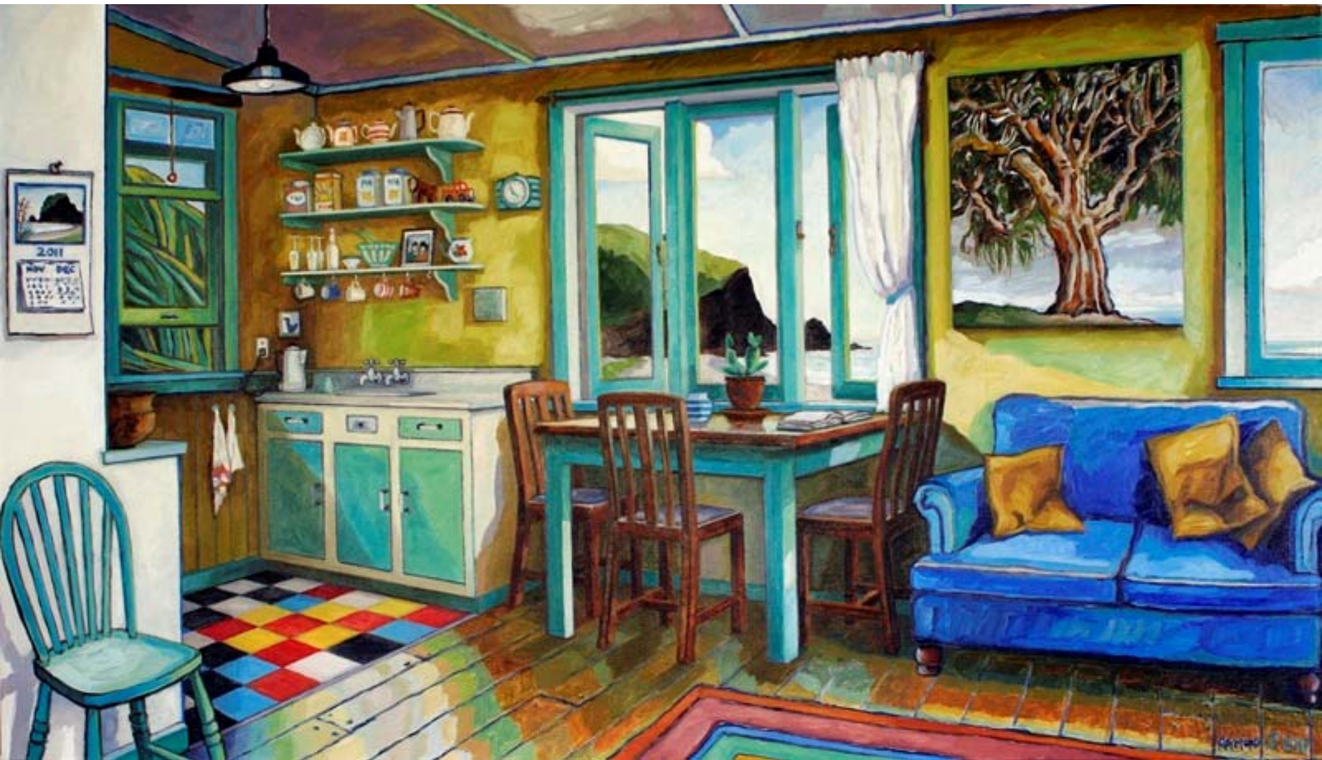
17. West Coast Cottage – Oils on canvas Size:1300mm x 750mm