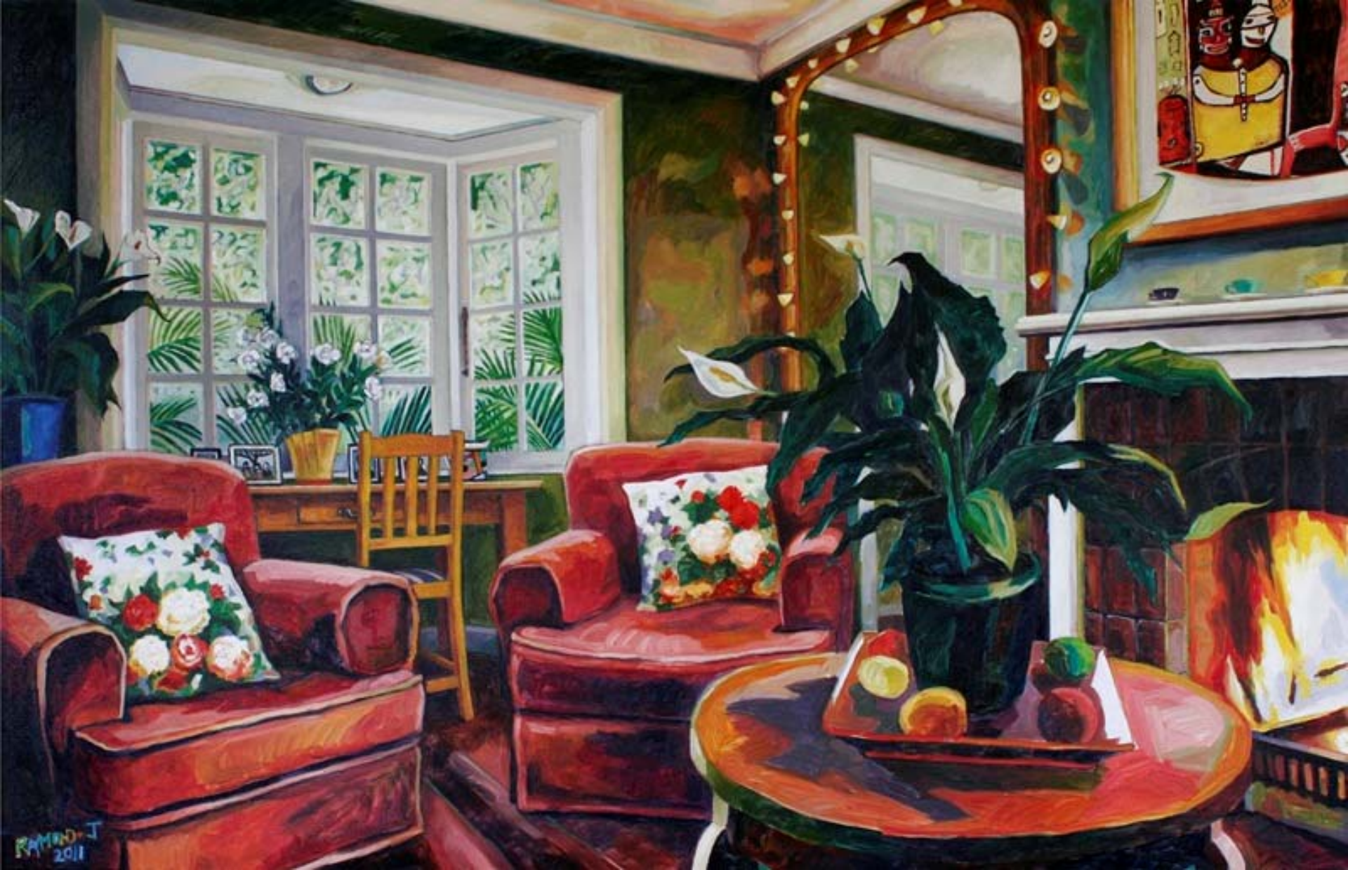
12. Luminous Interior - The heart of the fire – giving the colours to this painting together with the lights around the tall mirror.. and the plants dynamic in their green darkness, contrast with, and accompany the dancing flames. The outside light through the trees and window complete the trilogy – sun, electric and fire light. The faces in the Dolezel painting, give an eccentric human presence.