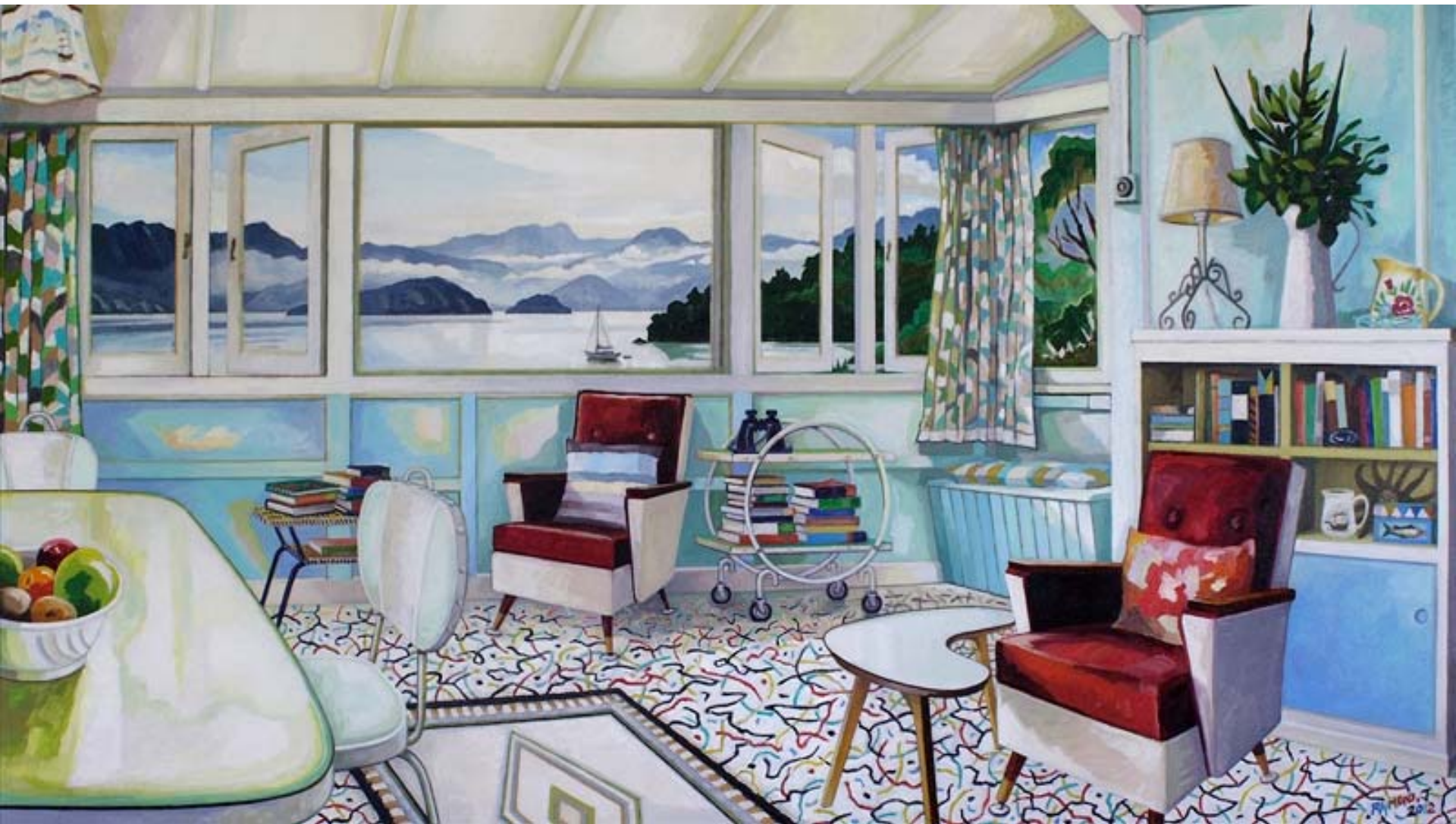
19. New Zealand Beach Interior – Oils on canvas Size: 1500mm x 820mm