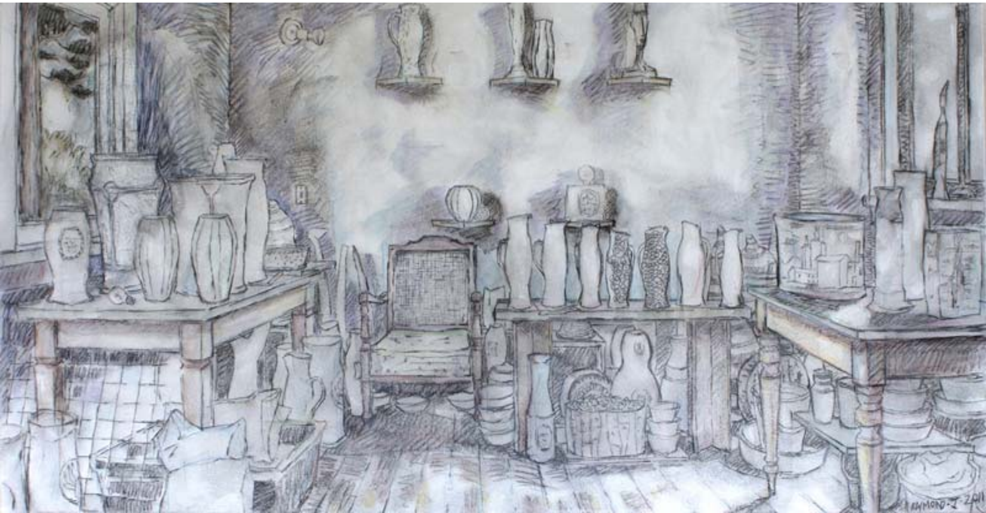
21. Pottery Studio – Pencil & oil colours with varnish wash Size: 1100mm x 530mm