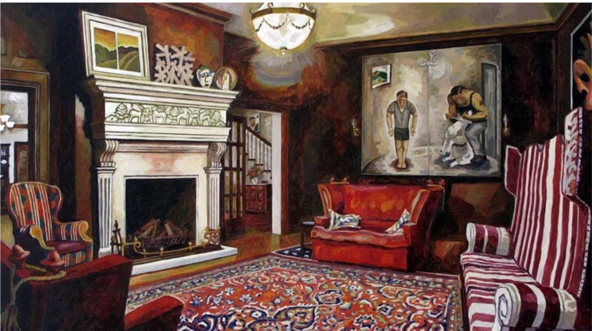
3. Portrait of an Interior - Portrait of Rannoch house, the home and concert hall of New Zealand's largest art collection owned by Sir James Wallace. A luminous, splendid combination of contemporary art and old architecture . . . and the chairs always holding the presence of people.