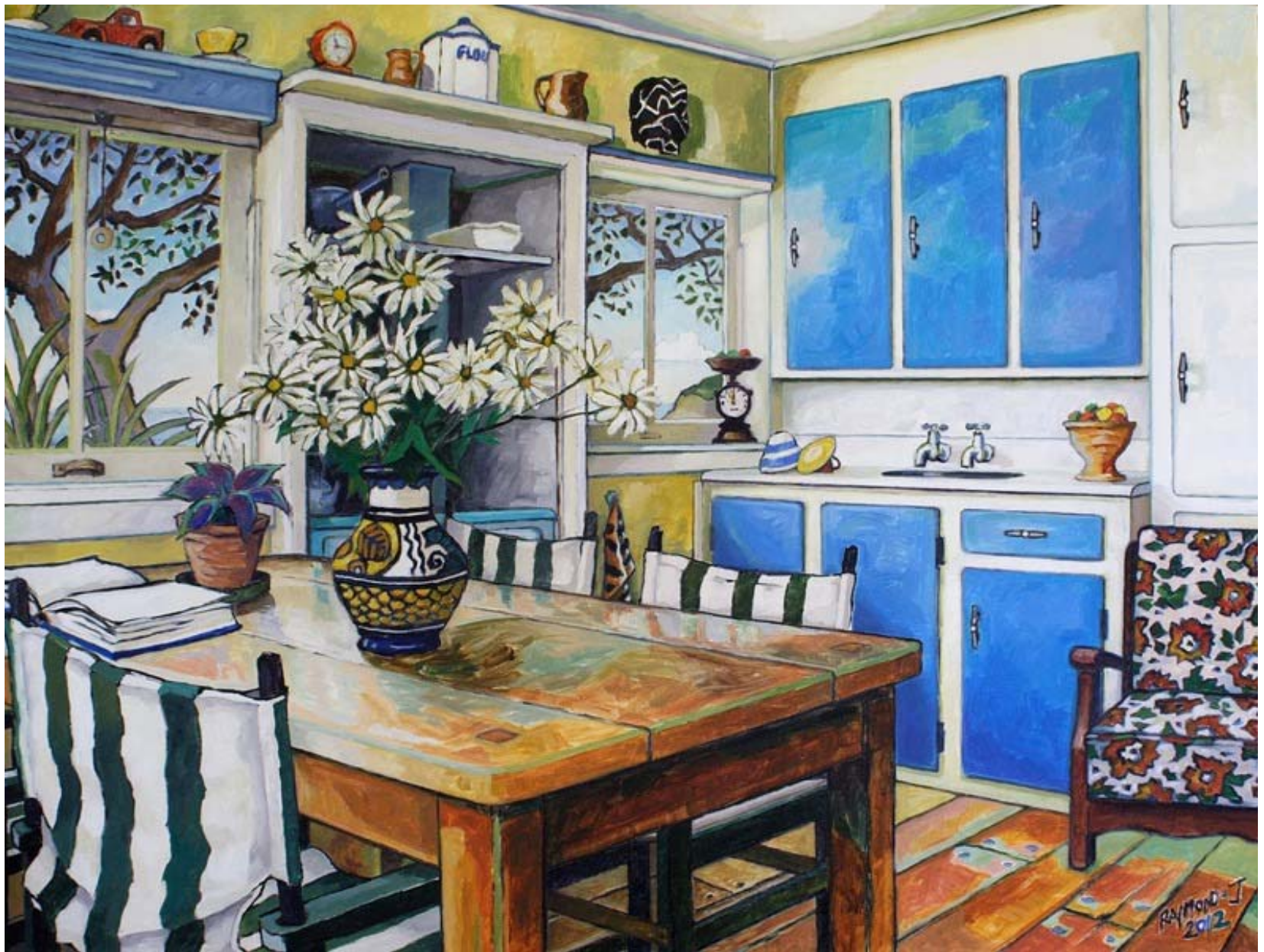
26. Ollie's Cottage – Oils on canvas Size: 100mm x 750mm