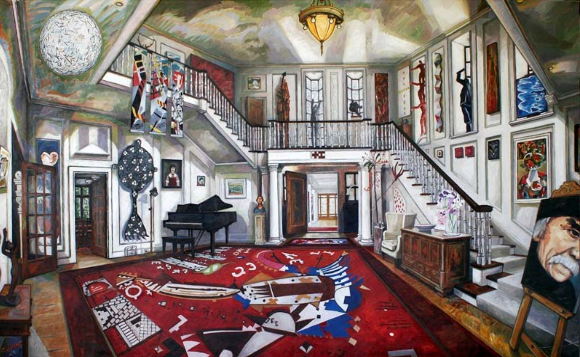
9. Rannoch – The Power of Expression – New Zealand Art 2011 - Home and concert hall of arts patron Sir James Wallace and his expansive collection of New Zealand art. An historic architectural and contemporary-creative experience with its musical atmosphere and artist presence and its invitation to wander, exploring the rooms and multiple levels all filled with art.