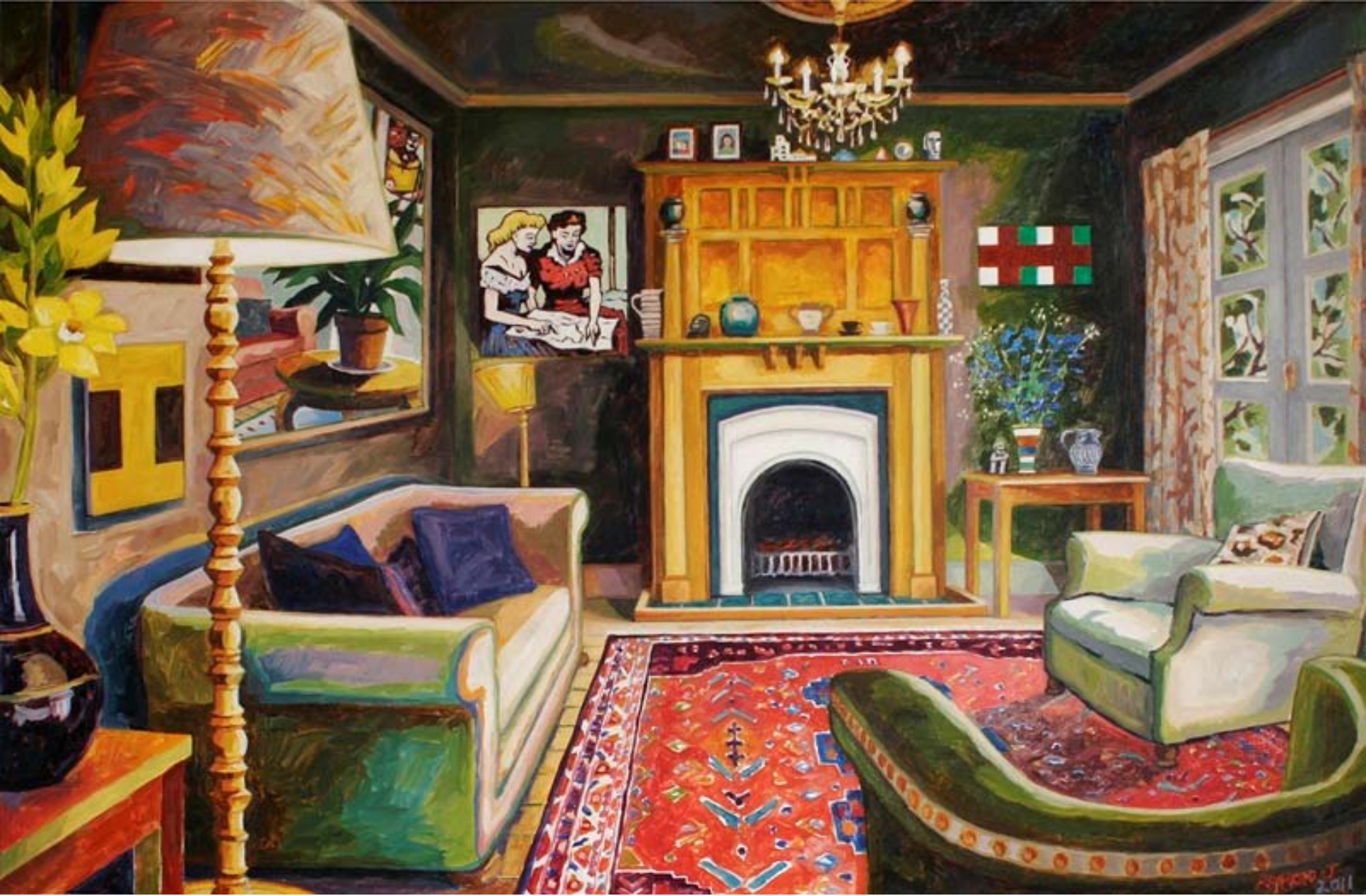
13. Creative Interior - Oils on canvas Size: 1500mm x 1000mm