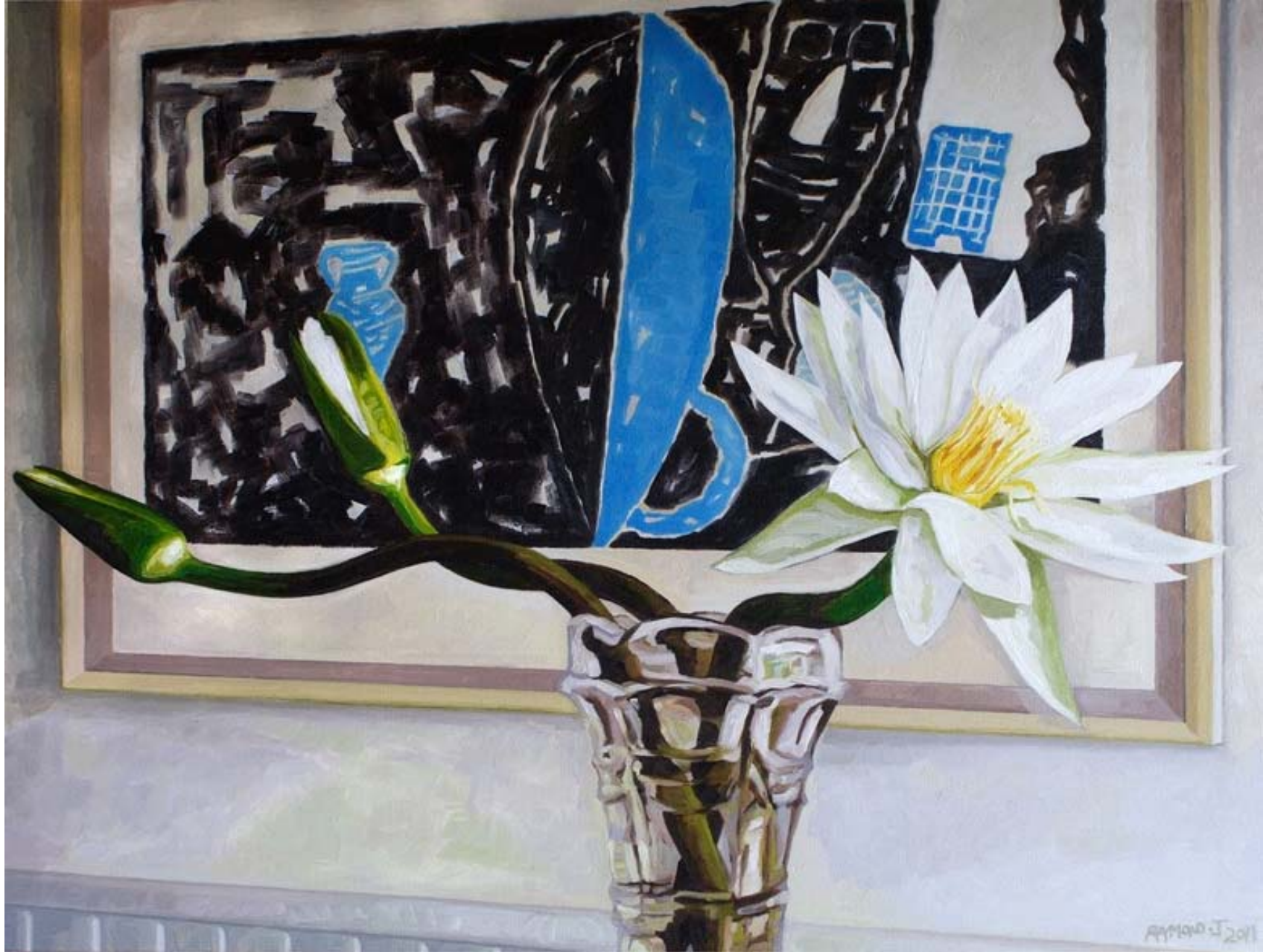
16. Water Lily with monoprint by Denys Watkins - A water lily bloom against mono-printed images of Easter Island by Denys Watkins. The naturalistic association of a present day flower as a beacon of light with the cultural images of an historically and geographically distant island. Oils on canvas Size: 1000mm x 750mm