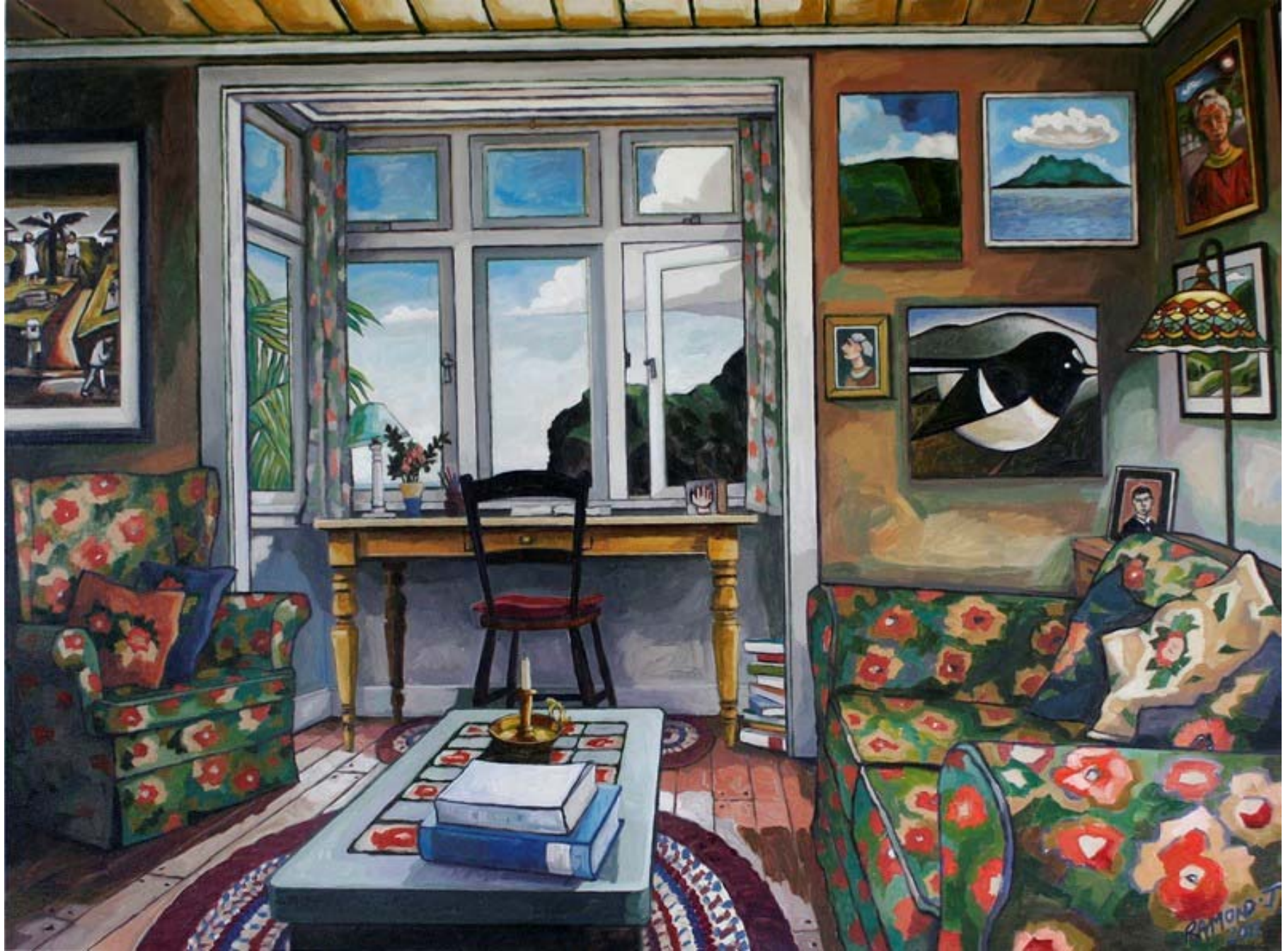
11. Beach House at Piha 1290mm x 960mm - A small cozy house overlooking Piha beach ... with paintings by Rita Angus, Don Binney, Nigel Brown and Colin McCahon, as connections to our country's culture and history, beyond the immediate relative isolation of this coastal location.