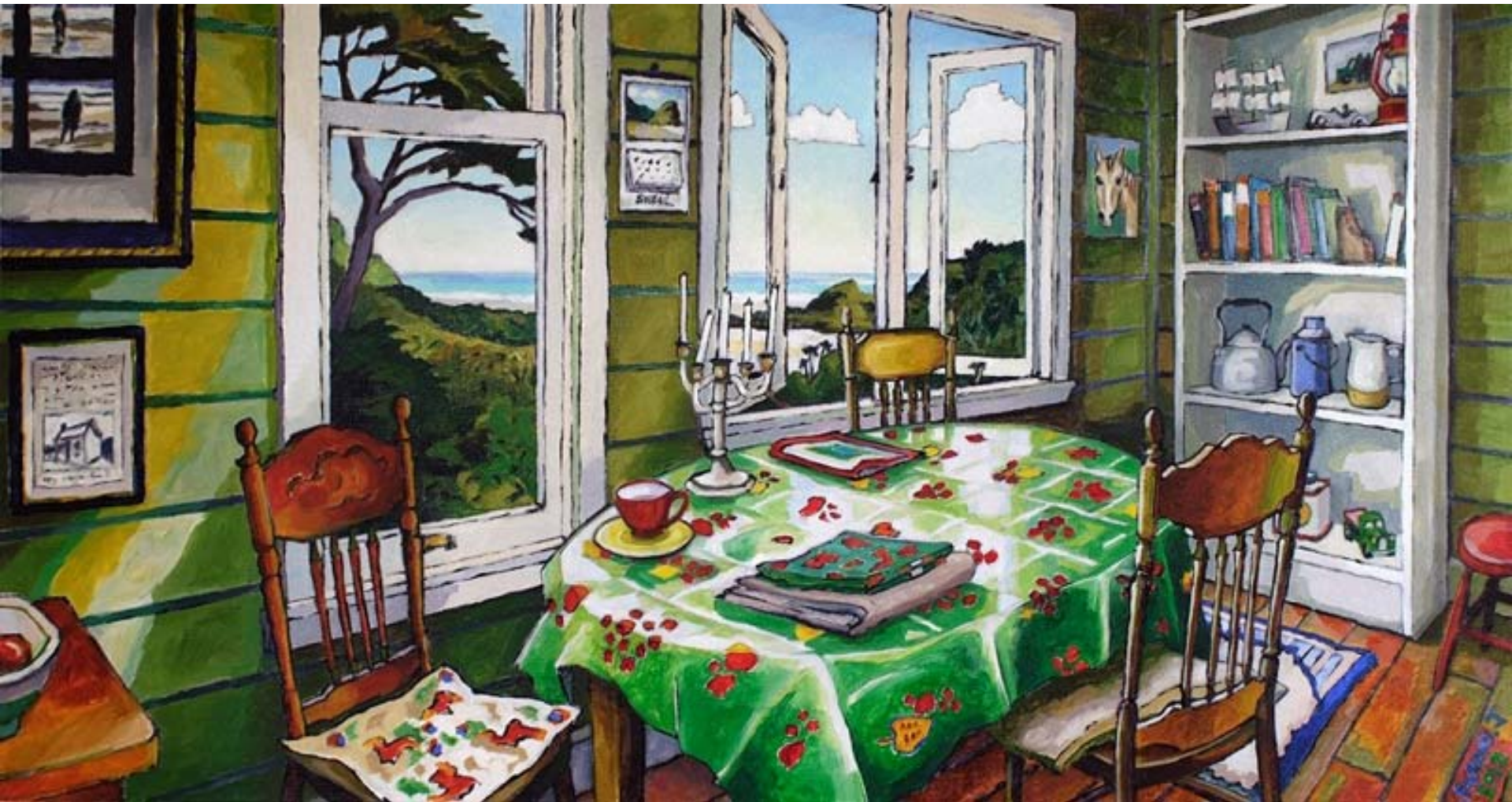
18. Bethells Beach Bach - Oils on canvas Size: 1000mm x 500mm