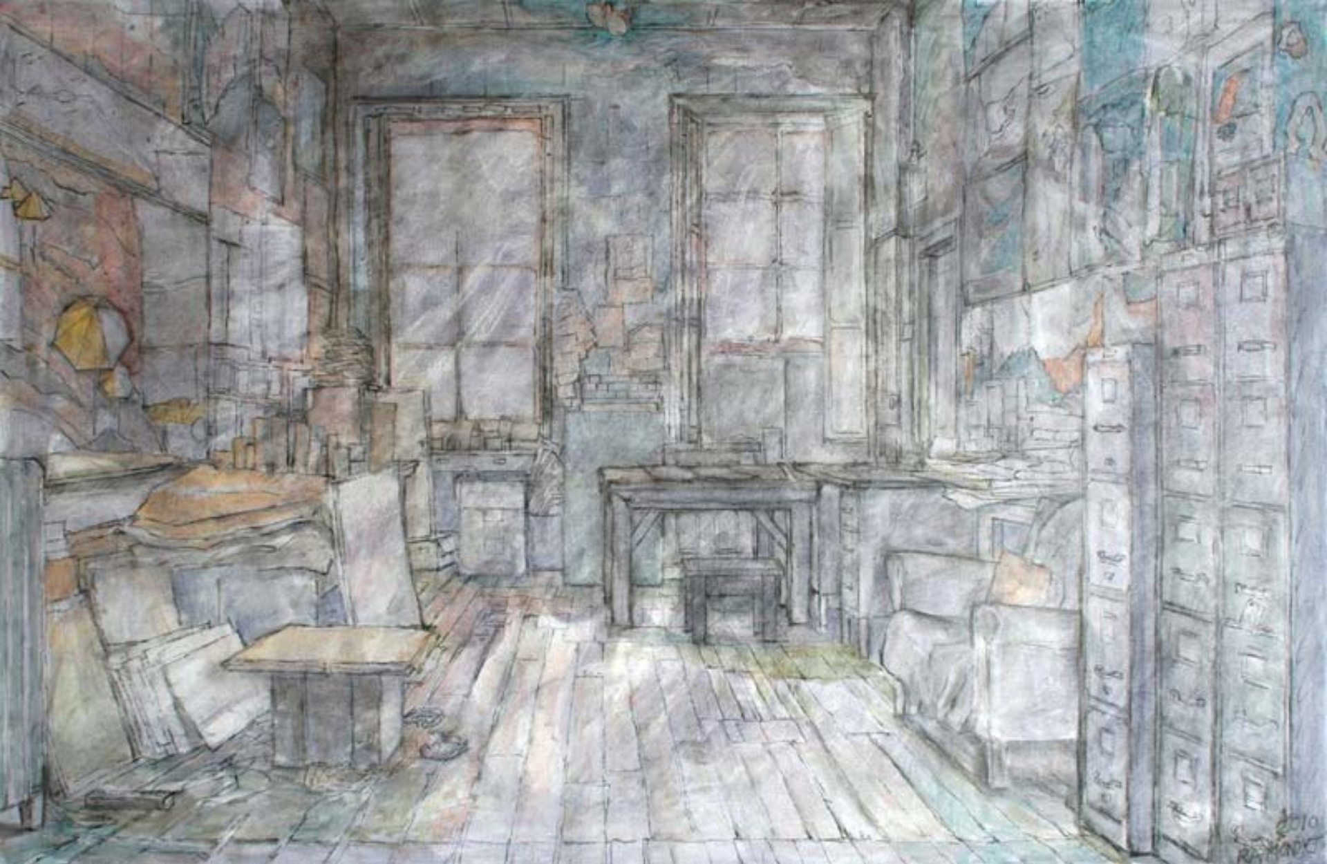
10. Christo's Studio, New York City 1988 - An expression of the mysterious – enchanting, solitary and productive atmosphere of this studio ... with rolls and stacks of paper, and drawings covering the walls rendered with pencil and colour wash, with varnish, to hold the effect of the muted light from the muted windows, and giving the overall suggestive quality for our mind and imagination to find some definition and intrigue.