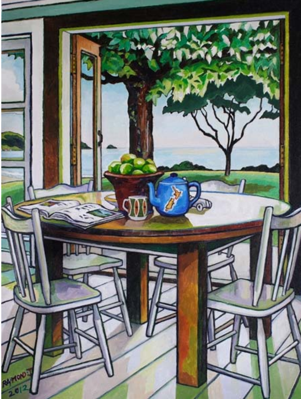
20. Old Bach at Pataua – Oils on canvas Size: 850mm x 600mm