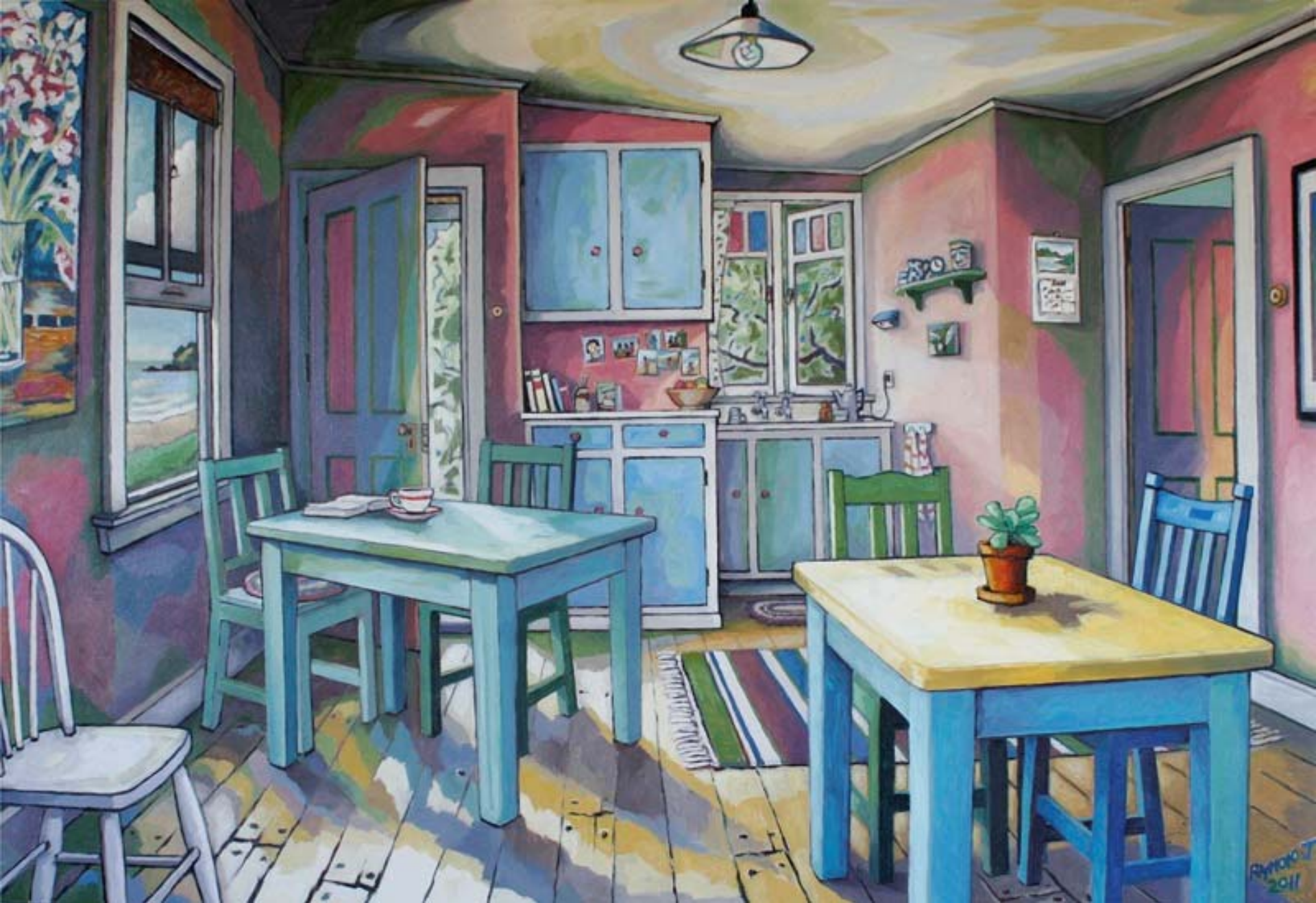
8. Northland Bach Interior 2011 – or beach house, with its architectural simplicity, original 1950s colour scheme and abstract shapes of shadows and shade open to the free light of ocean and sky.