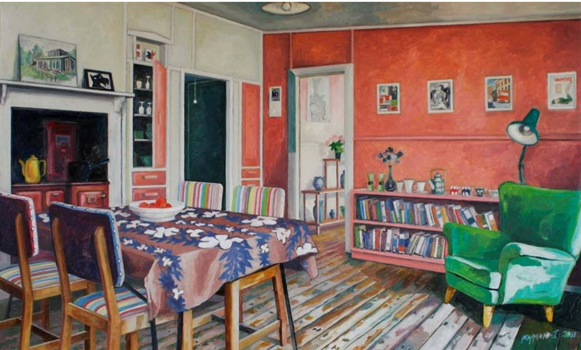
4. New Zealand Bach Interior - A portrait of a New Zealand beach bach built in the 1930s and maintained in its original form and colours, with the addition of collectables and furniture form of the 50s, 60s and 70s. A simple weekend haven for a couple of university lecturers. Chairs hold the presence of people. Forms of space lead through on the musical lines of the floorboards into other rooms and into the darkness inside the fireplace and cupboard . . . a balance of mystery and lightness.