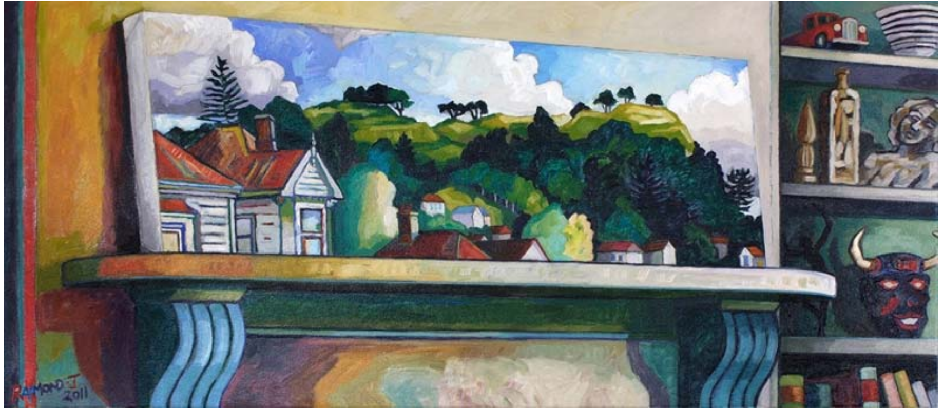
24. Shelf Life with Mt. Eden – Oils on canvas Size: 1060mm x 460mm