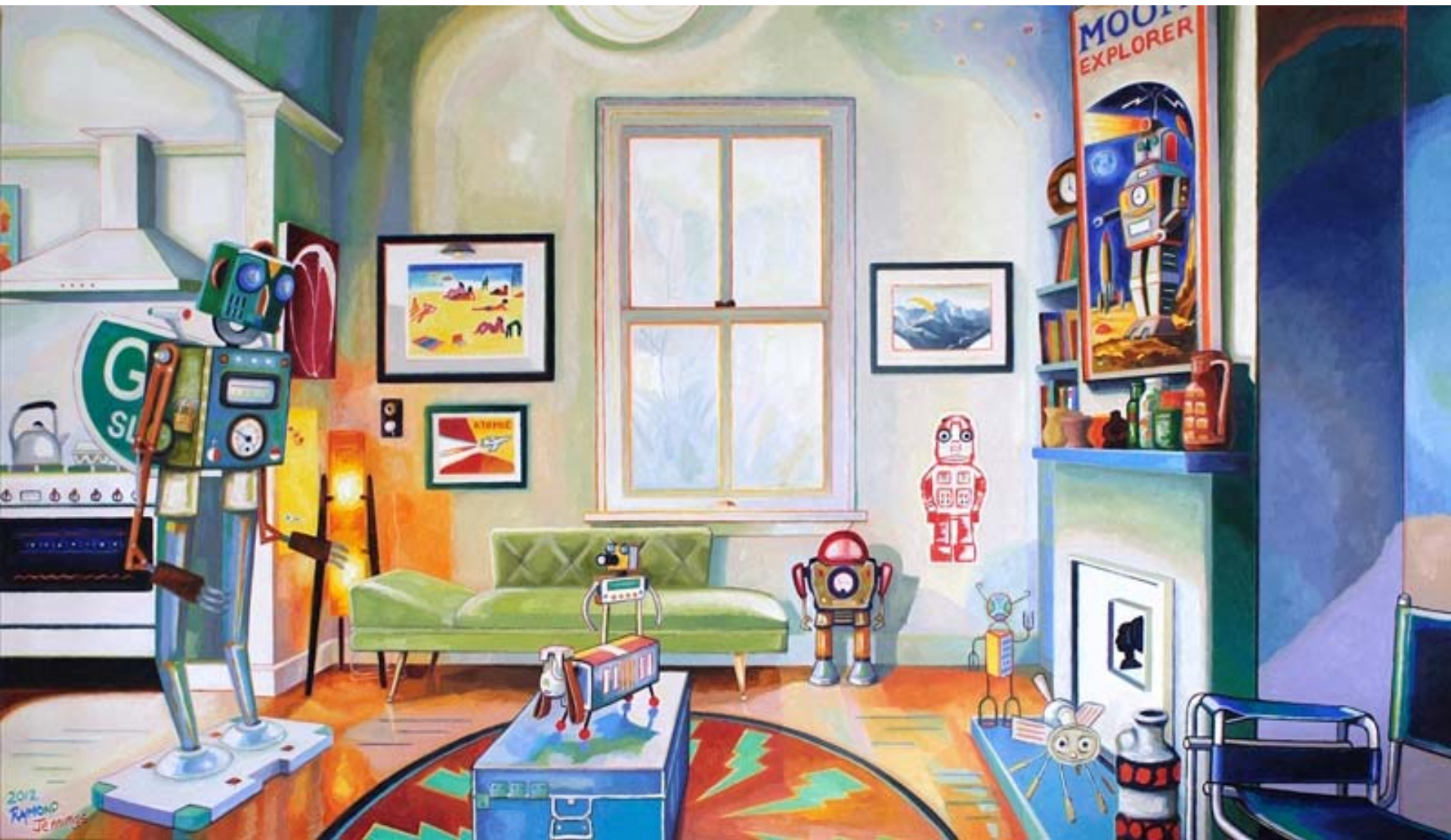
27. Robot Interior - Oils on canvas Size: 1500mm x 830mm