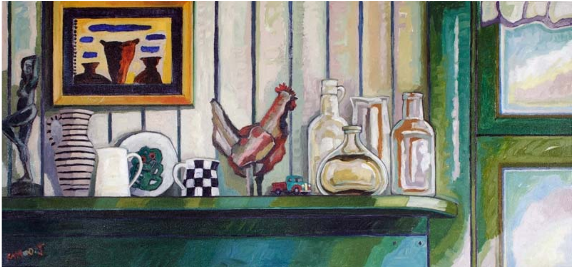
25. Shelf Life – Oils on canvas Size: 1050mm x 490mm