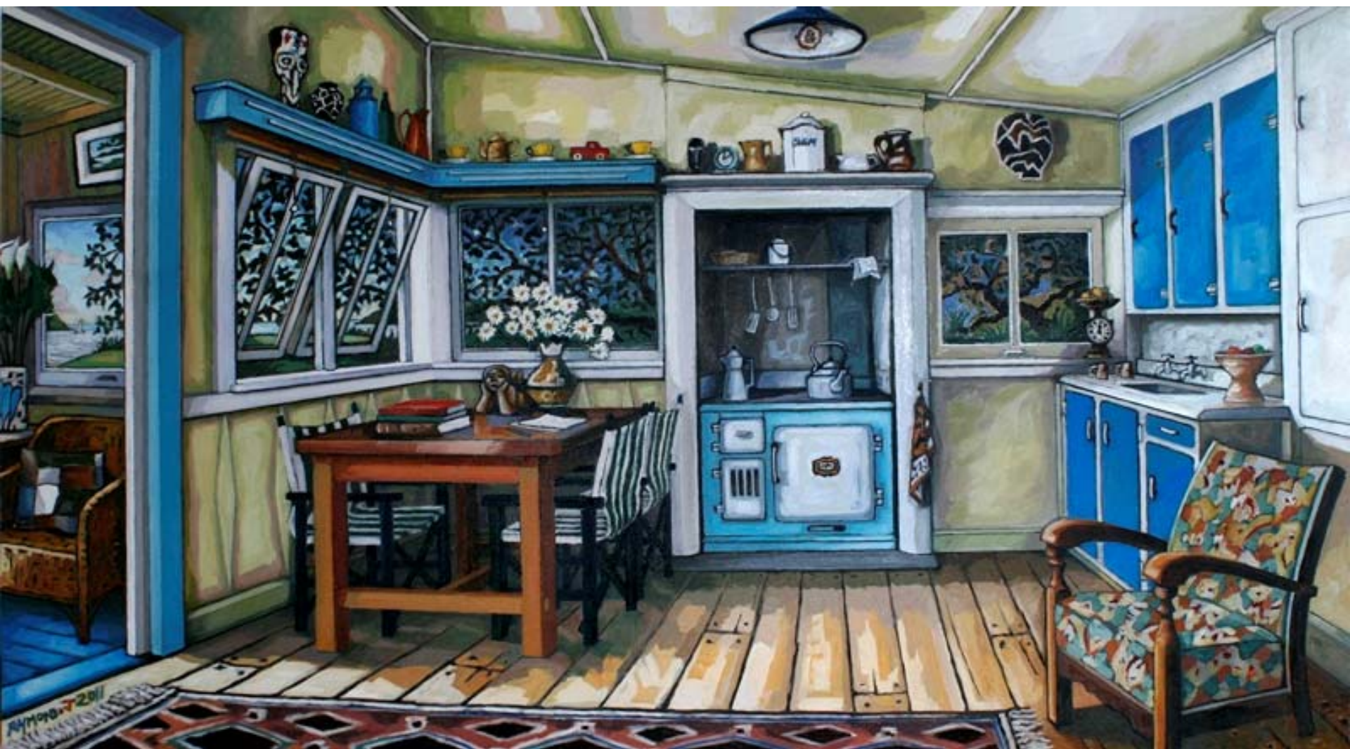
7. Great Barrier Island Bach 2011 - Home base of a New Zealand travel writer, this bach built in the 1910s is in its original condition, well-maintained and well-weathered. This interior exhibits some iconic kitchen collectables, together with ethnic masks and vessels from Africa and tropical island cultures. Windows, like pictures on the wall, open out all around to the expansive spread of a native coastal pohutukawa tree . . . with the ocean horizon as a line of reference and connection to the outside world beyond this personalized interior haven. Comfortable muted colours contrast with the brilliant blue and teal greens as a luminous reflection of the space of summer's sky above.