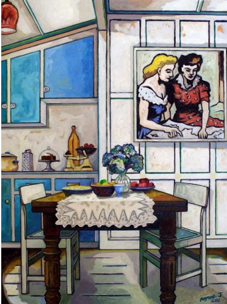
15. The Map Readers - Oils on canvas Size: 680mm x 900mm